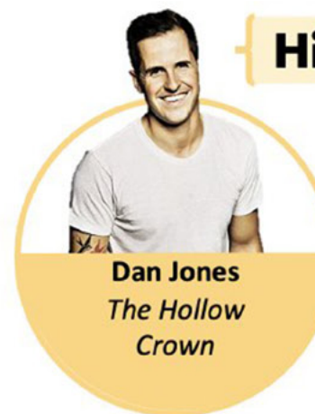
Dan Jones The Hollow Crown