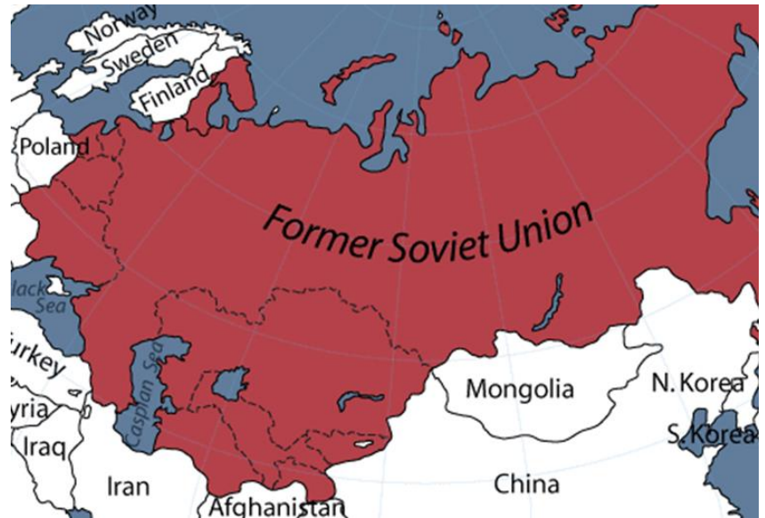
Figure 3: Map of the Soviet Union's borders in 1979 prior to their invasion of Afghanistan

The Soviet invasion of Afghanistan on the 24 th of December 1979 was another event that substantially shifted Middle-Eastern and Western relations. The USSR aimed to strengthen a communist neighbour with the invasion (Figure 3) but faced fierce resistance from local Mujahedeen freedom fighters. These Islamic groups consisted of divided factions that rose from local militia or warlords, with the seven major groups uniting as the Islamic Unity of Afghanistan Mujahideen due to the support of outside countries. 38 The US in particular played a significant role in the Afghan-Soviet war, providing the Mujahedeen with money, rations and weapons such as the Stinger Missile. 39 The leaders of different Mujahedeen factions were appointed for