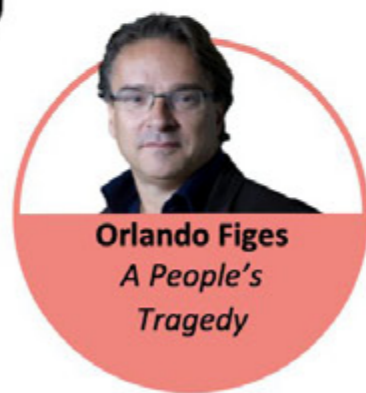
Orlando Figes A People's Tragedy

"Time and time again, the obstinate refusal of the tsarist regime to concede reforms turned what should have been a political problem into a revolutionary crisis ...The tsarist regime's downfall was not inevitable; but its own stupidity made it so."